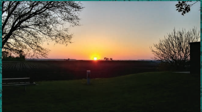
Top Left: Memorial rock at Harold and Mildred Linder Conservation Area Top Right: Sunset over 4th Pumping Plant Recreation Area