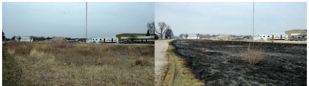
Prescribed Burn in the prairie at the main office

Cut 10 acres worth of overgrown cedars and placed them in wildlife friendly piles. We then partnered with a local landowner to utilize "mob" cattle grazing techniques on 12 acres at Hickory Bend Recreation Area. The combination of wildlife friendly brush piles and the rest periods associated with mob grazing have resulted in the area being utilized by bobwhite quail and many other species this spring. Additional plans for the area include TSI, cool season grass conversion to native grass and wildflower mix, prescribed burning, and maintaining food plots.