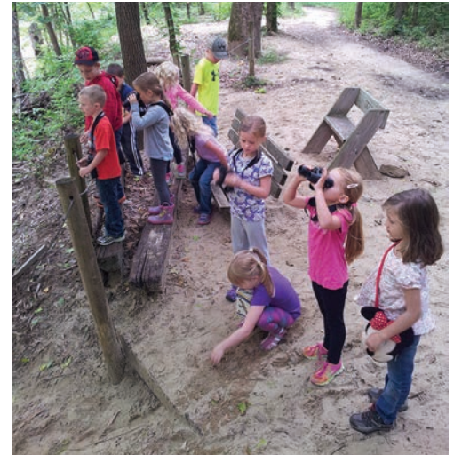
Program at Starr's Cave Nature Center

This year we provided 210 educational programs throughout the Fiscal Year to 8798 participants. Any decrease in program and participation numbers can be attributed to staff time spent developing CEP exhibits, programs, and materials. Classroom time was also reserved for presenting REAP CEP specific programs. The EE highlight this last year is completing 2nd floor renovations and exhibits, and receiving an award for best interpretive print media from the Iowa Association of Naturalists for our water quality critter cards.