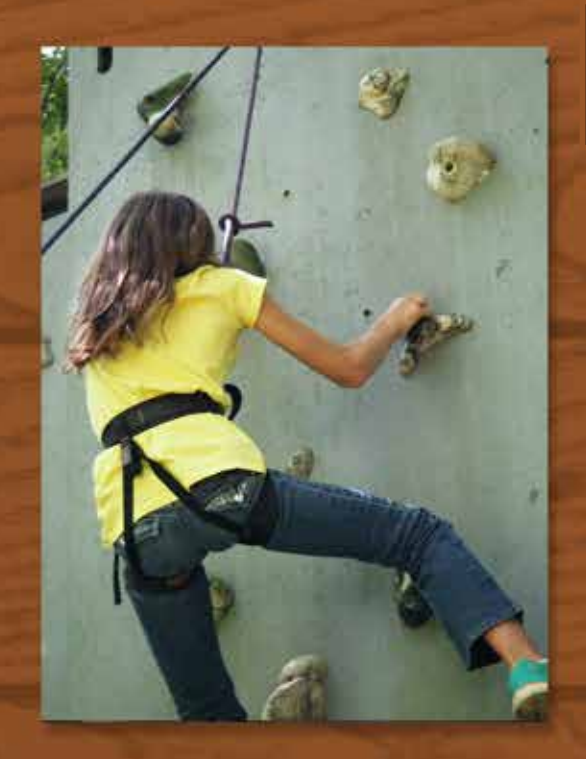
Top Left: Classroom EE Program Top Right: Critter Catch at Big Hollow Lower Left: Rock Climbing at SCNC Lower Right: Habitat improvement at Big Hollow